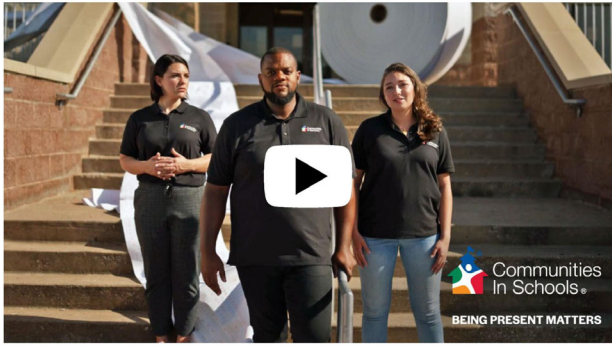
Communities In Schools