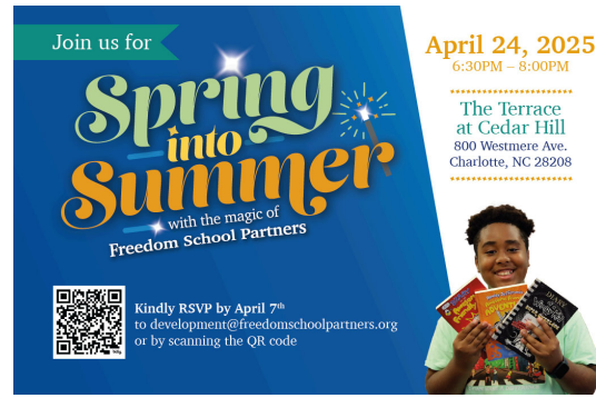
Freedom School Partners