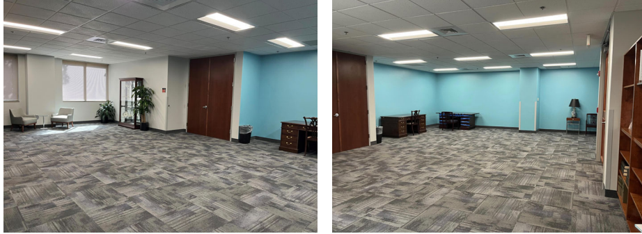
Former Library Space

Recently, an area adjacent to the main lobby was repurposed from an open, underutilized space, to two new conference rooms with video conferencing capabilities. Our Board of Directors was instrumental in bringing this space to life as they donated the funds needed for this capital improvement. Demand for meeting spaces continues to be high and repurposing this space with two additional conference rooms is already making a difference!