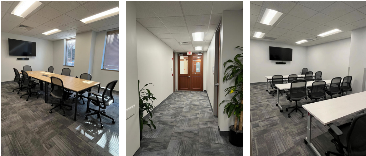
New Conference Rooms and Hallway